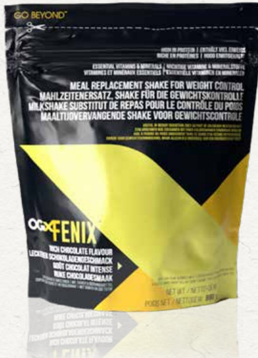
OGXFENIX™ CREAMY VANILLA