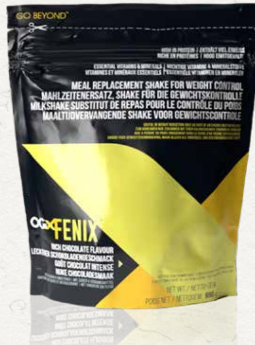
OGXFENIX™ RICH CHOCOLATE

OGXFENIX™ is an exclusive protein shake mix that combines a concentrated whey protein along with vitamins, minerals, prebiotic fibre, and an exclusive ganoderma mushroom to create a delicious weight management shake to help transform your lifestyle. This is no ordinary blend – OGXFENIX™ provides a complete and nutritious meal replacement in minutes. When combined with regular exercise and eating a proper balanced diet, nutritional shakes can be effective in managing weight and helping you live a healthy and active lifestyle.